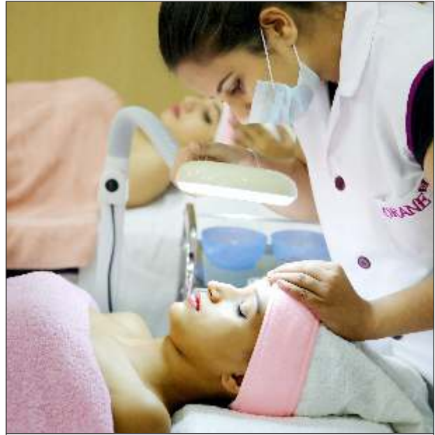
Cosmetologist performing Skin Treatment

An Aesthetician specializes in the study of skin care, including facials, micro-dermabrasion, body wraps (relaxing treatments which involve hot linens, plastic sheets, and blankets), salt glows (an exfoliation treatment), waxing as a form of hair removal, cosmetic make-up services and other services with advanced training. In addition to performing beauty services, an esthetician must be skilled in recommending skin and body care products and retailing them to their clients.