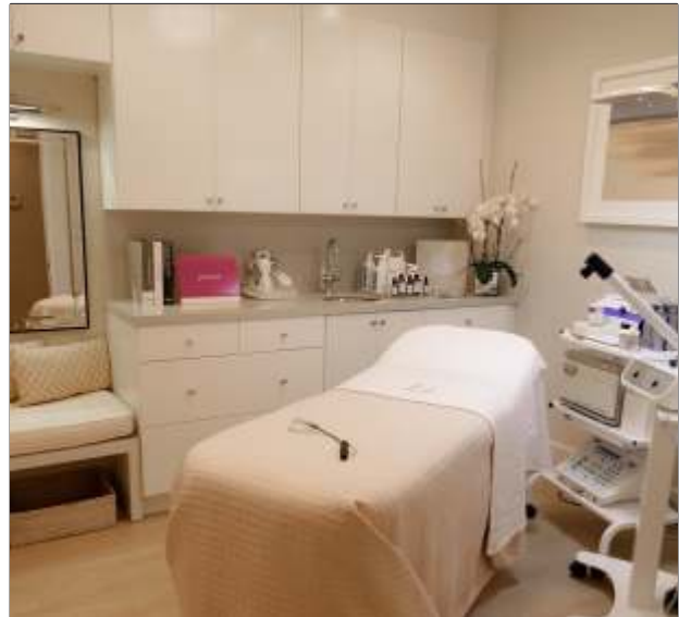
The Treatment room should be properly sanitized before starting with the treatment to avoid Infection.