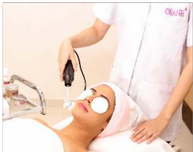
Disinfection of electrical gadgets for client's safety and your own.

It is the lowest level of decontamination. To