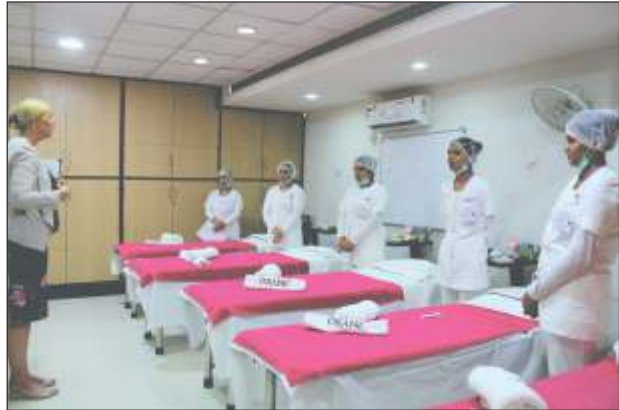
Professional Ethics Class