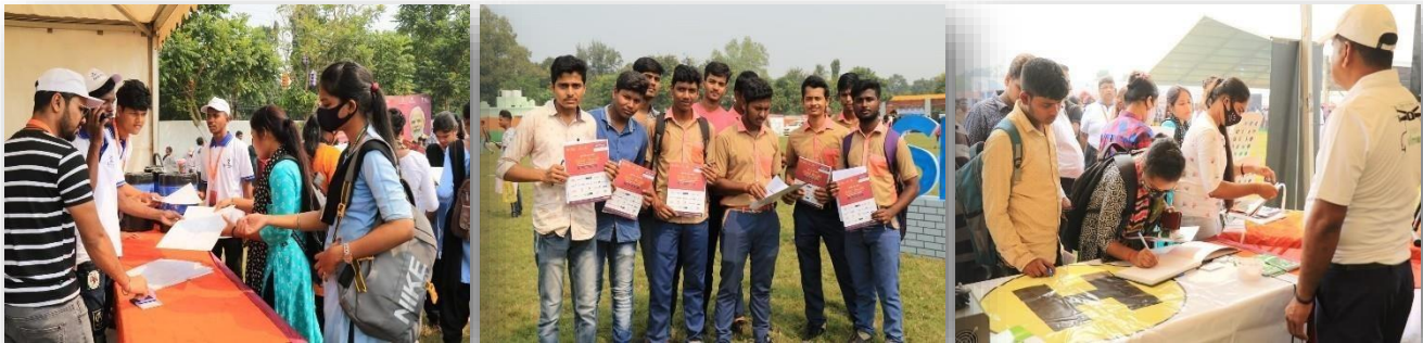
Glimpses of Candidate registration during the event