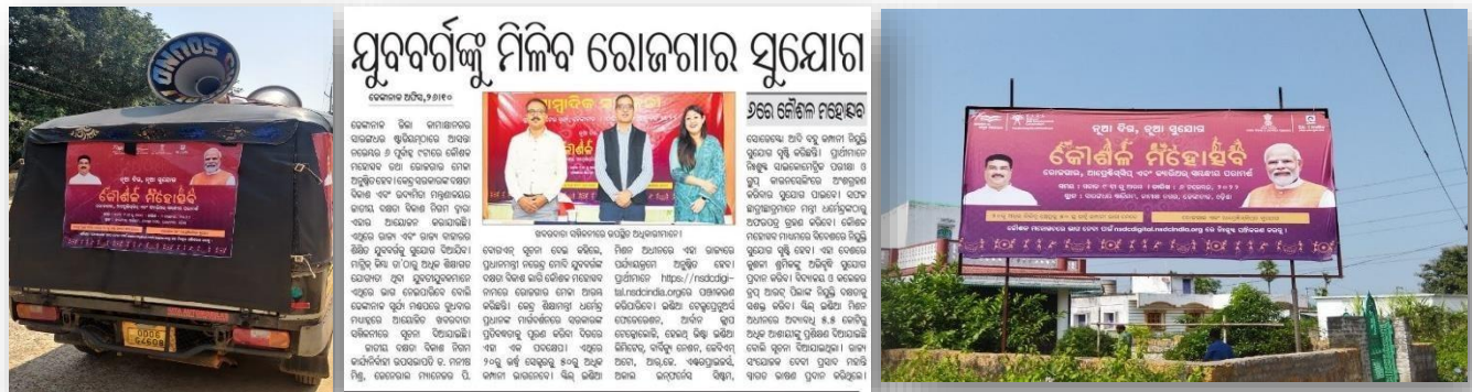
Glimpses of event branding and promotion