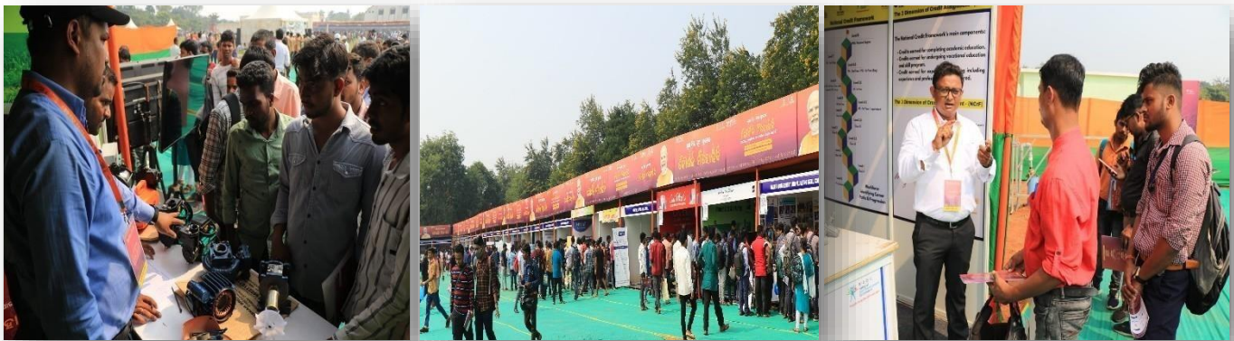
Glimpses of skill exhibition