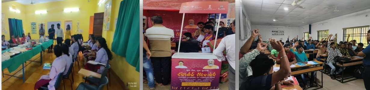
Glimpses of candidates getting pre-screened

Some of the employers who actively conducted pre-screening of candidates were Urban Company, Grant Thornton (for Shahi Exports, Vardman Fabrics), Vision India (for Maruti) and Creative Engineers (for Honda, Wistron), Jindal Steels Works, Etc.