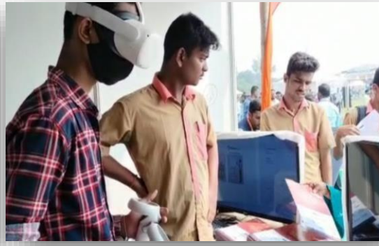
Glimpses of Drone and AR-VR