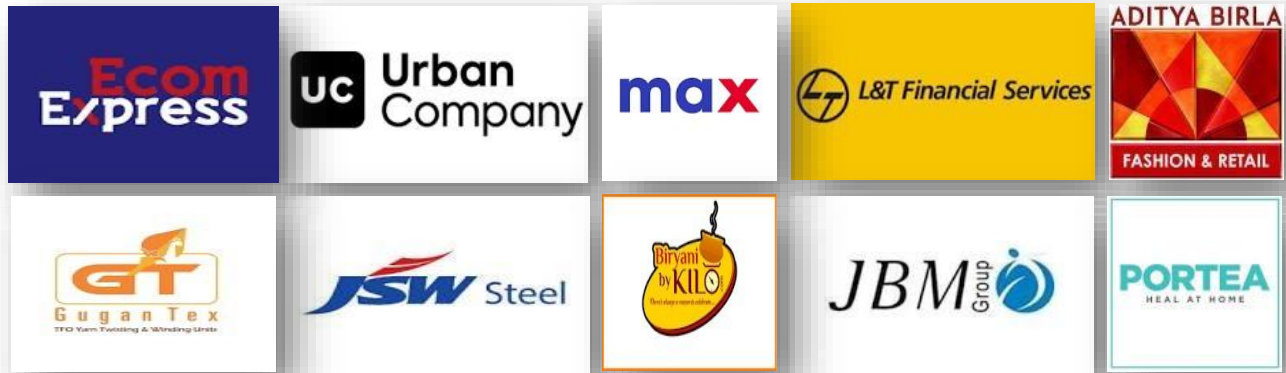
TOP 10 SECTOR BASED ON NUMBER OF PARTICIPATING EMPLOYERS